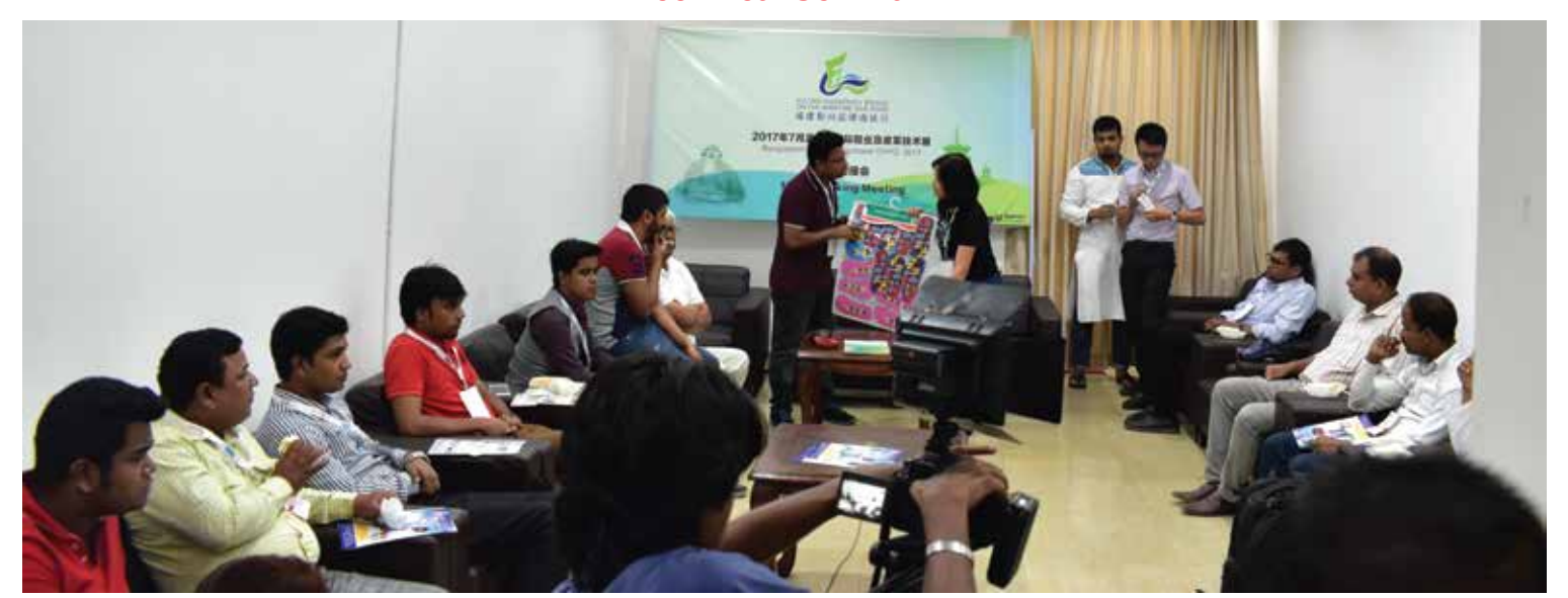
Buyer & Seller Meeting